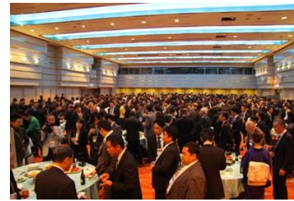
"Opening Reception" on Nov. 4 th