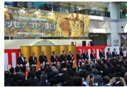
"Opening ceremony" (400 attendants)