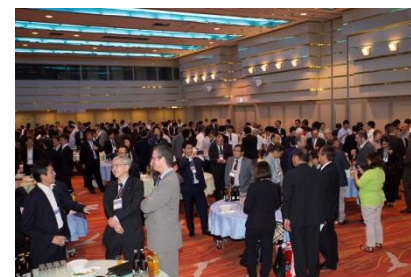
Opening Reception on Oct. 26 th