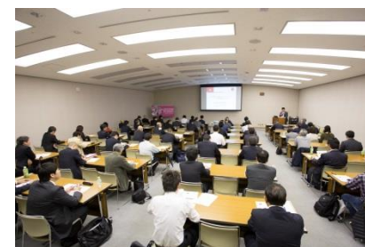
Global Seminar on Oct. 27-28 th