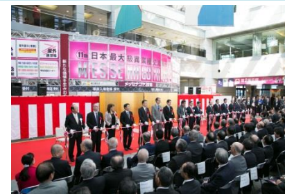
Opening Ceremony (350 attenders)